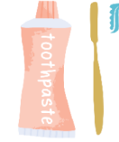
刷 ク 牙 ト