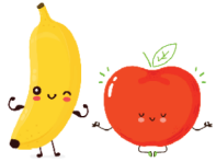
小 ク 吃 ト