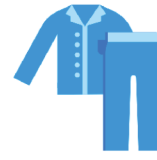
穿 ク 睡 ト 衣 ト