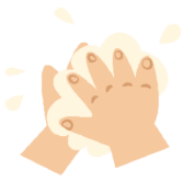
洗 フ 手 ト