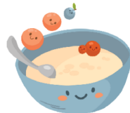
早 ク 餐 ト