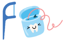
用 ク 牙 ト 線 ト