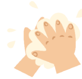
洗 フ 手 ト