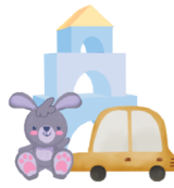
玩 ク 具 ト