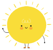
起 レ 床 ト