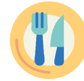
晚 ク 餐 ト