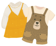
穿 ク 衣 ト 服 ト