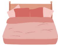
鋪 ク 床 ト