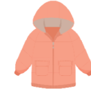
穿 ク 外 ト 套 ト