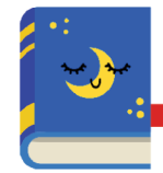
故 ク 事 ト 時 ト 間 ト