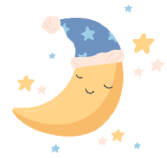
睡 ク 覺 ト