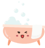
洗 フ 澡 ト